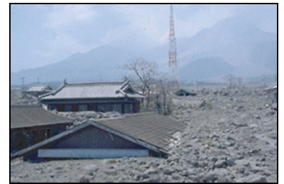
After-effects of eruptions

Nature is unpredictable and disaster can strike at any time. Often the devastation left behind is vast, and in many cases it remains too dangerous to send construction crews in to repair the damage for weeks (or even months) after the event. In such circumstances, remotely-controlled unmanned construction equipment could play a valuable role, making the site safe for human operators and performing initial construction work.