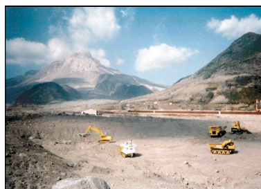
Fujita's unmanned site