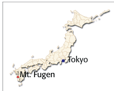
Location of Mt. Fugen