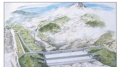
Check-dam No.2 (impression)

As of April 2000, the first check-dam was completed, and work well underway on check-dam No. 2.